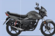
MATTE CRUST METALLIC