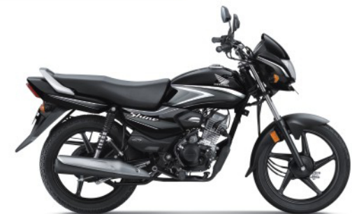
Black With Grey