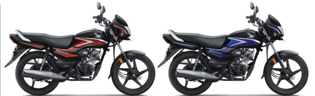
Black With Red